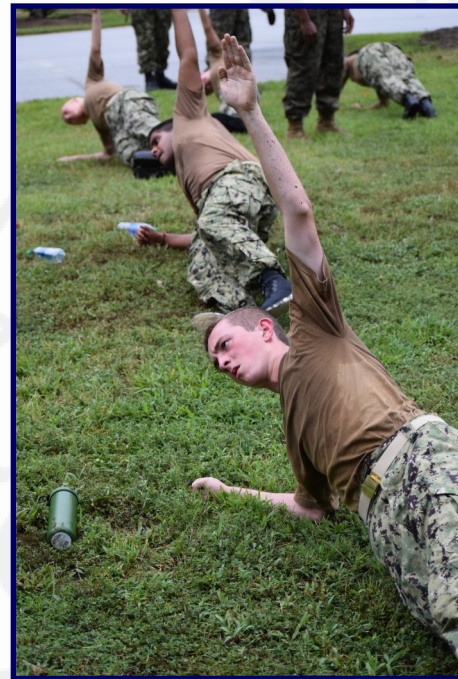
More photos on pages 6 & 7.

Lastly, they conducted the Medal of Honor run, where the midshipmen ran the loop again and stopped at stations. At each stop, a motivated 4/C would sound off and read a Medal of Honor citation of those who made the ultimate sacrifice. Afterwards, the 4/C enjoyed a consortium picnic and an opportunity to enjoy the day.