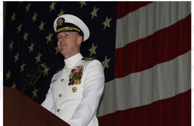
CAPT Foege gives his remarks during the change of command.