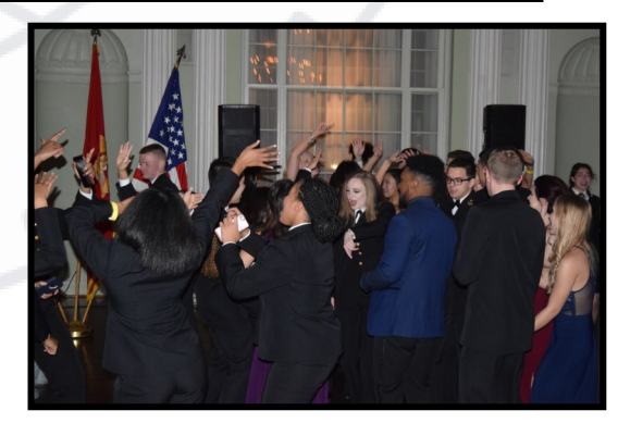
More photos on page 3.