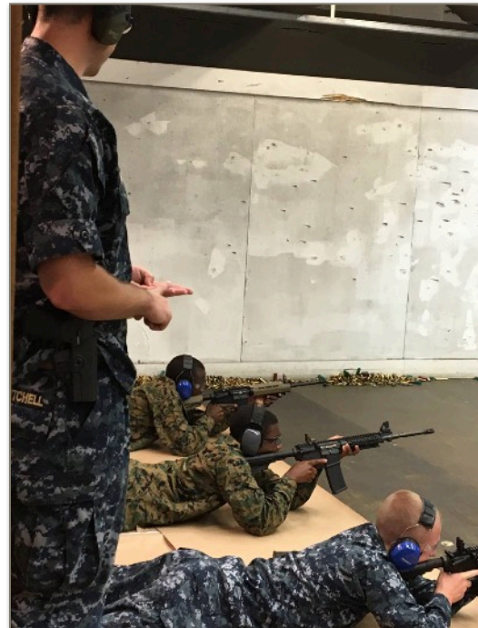
4/C slinging lead downrange at Quickshot Buckhead

swim PT at the CRC, and rifle and pistol familiarization training at the range at Quickshot Buckhead. The freshmen also received their new gear, were trained in basic close order drill, and were briefed on how to succeed in the NROTC battalion.