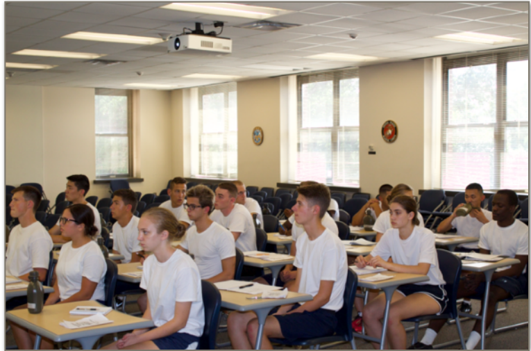
The new 4/C receiving classroom instruction on customs and courtesies

With the arrival of a new semester, we continued our annual ritual of training and indoctrinating our new freshmen into the NROTC battalion. Aspiring freshmen reported to the O'Keefe building bright and early on a Tuesday morning for a quick in brief from the Commanding and Executive Officers, then immediately hit the ground running. New Student Orientation (NSO) continued for 4 days, all ran out of the O'Keefe building at Georgia Tech. Training days included events such as an initial PFA/PFT,