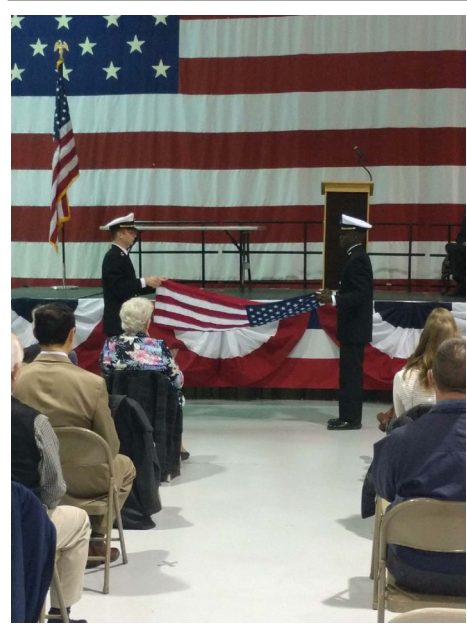
Above: Midshipmen perform the Old Glory flag ceremony

Right: Midshipmen perform color guard duties to start the ceremony