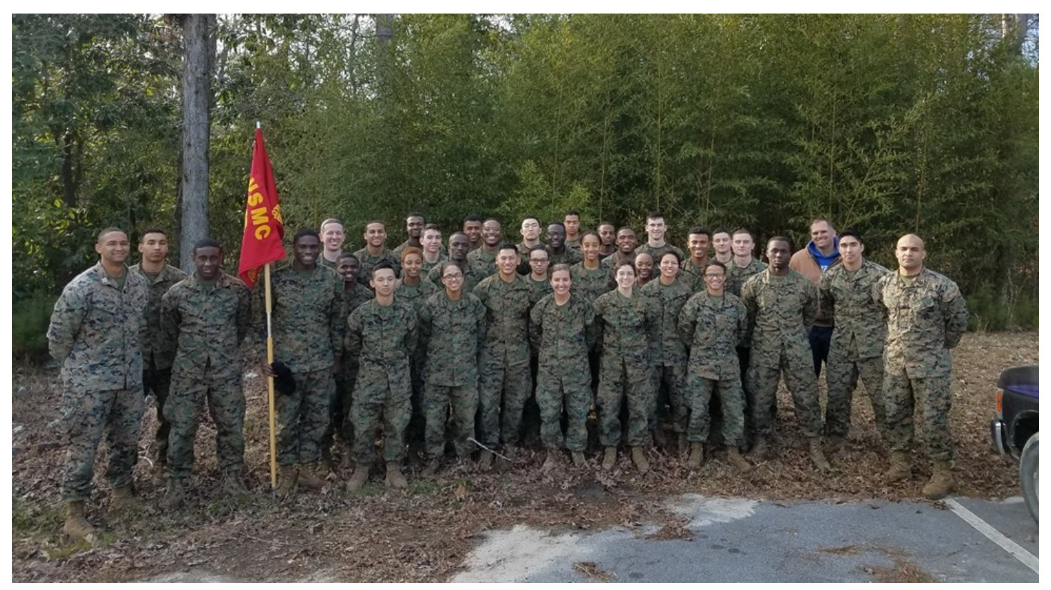
The Marine Platoon is full of smiling faces after a long day of satisfying, albeit difficult, work.

Both the hike and SULEs were done using the land on Camp Westminster in Conyers, GA. Camp Westminster and the Atlanta Region Marine Platoon have had an ongoing partnership for over 5 years thanks to a former Marine Option from the platoon. The community service itself serves as a way for the platoon to not only get away from the struggles and monotony of everyday college life, but also to get in touch with the civilians they one-day hope to protect. The platoon visits Camp Westminster every semester and plans to keep the relationship alive and well by providing their time, energy, and sweat whenever possible.